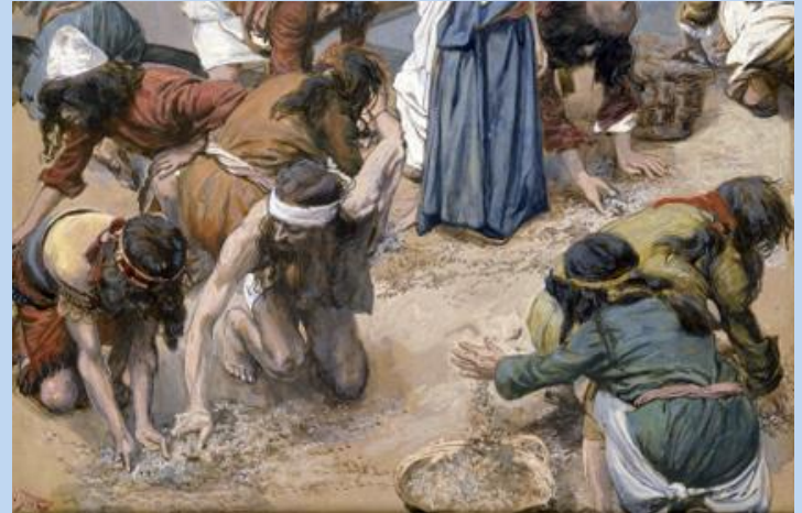
The Gathering of the Manna, James Tissot

The crowd in today's Gospel demanded a sign from Jesus. May our faithful stewardship be a sign to others that we, like the Ephesians in the second reading, have laid aside our former way of life and acquired a “fresh, spiritual way of thinking” in Christ.