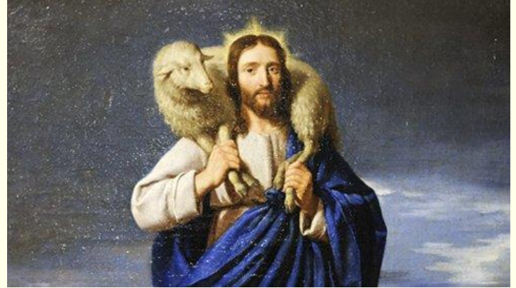
Jesus Good Shepherd 1602 -