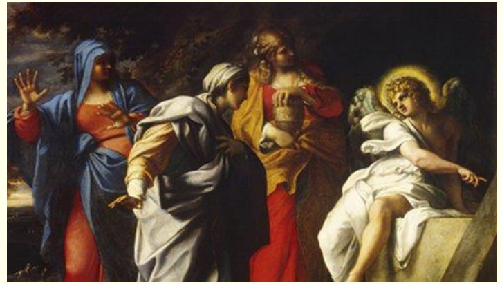
Annibale Carracci - Holy Women at Christ's Tomb (c. 1590s)

The Resurrection is the climax of the Incarnation. It confirms the divinity of Christ and all things which he did and taught. It fulfills all the divine promises made for us.