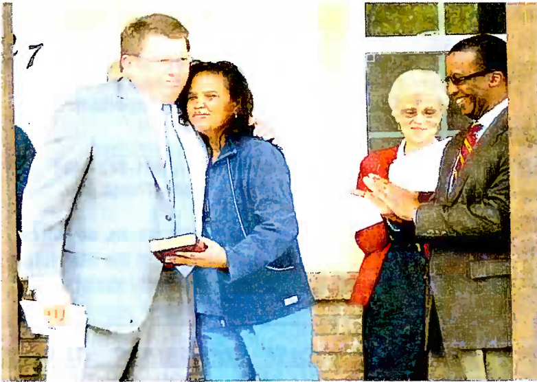
2011 Catholic Build Dedication "Love in Action"

NO EXPERIENCE? NO SKILLS? NO PROBLEM! We have a job for everyone 16 years (with supervision) and older. (Under 16 not permitted on jobsite - insurance requirements.)